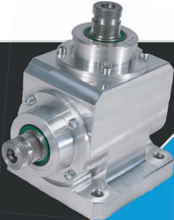
STAINLESS STEEL STEERING BOX